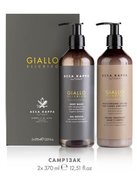
ACCA KAPPA Jal 1869

Immerse your guests in an environment where modern design seamlessly meets sophistication, leaving an enduring impression of contemporary luxury.