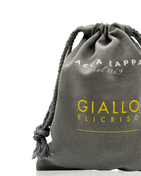
SAC3AK empty pouch